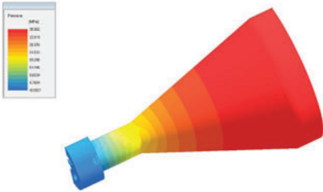
Pressure drop across flow field simulation

Editor’s note: This formula is meant to be insightful, if not necessarily accurate, as screw rpms, material viscosity, and the geometry of the discharge screw elements all play significant factors in the actual melt temperature.