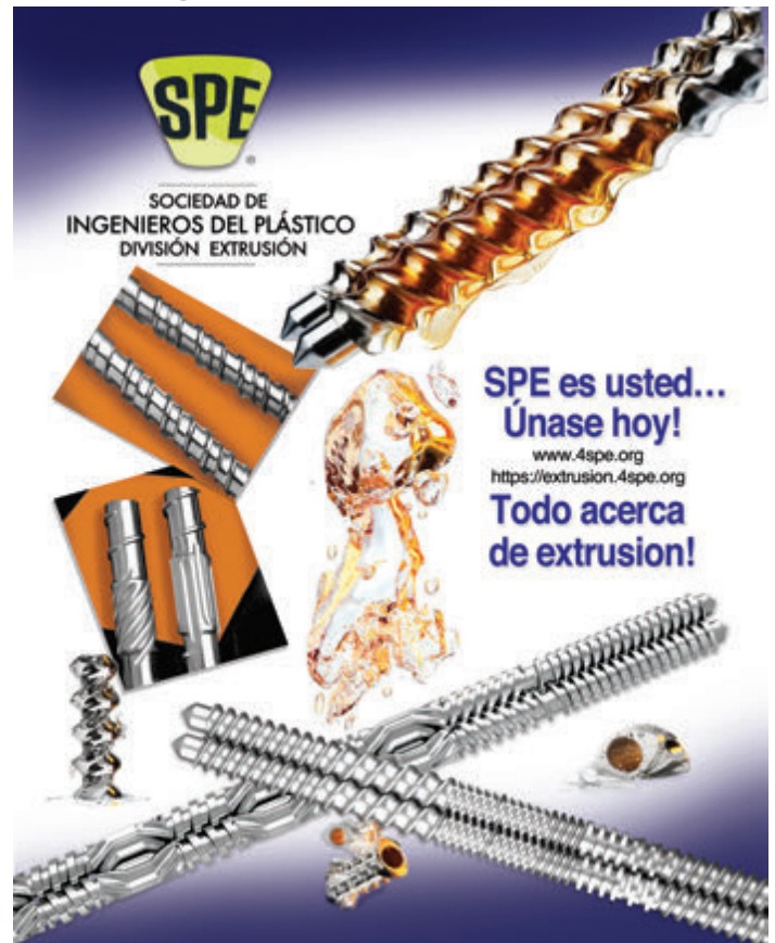
SPE Spanish display (screw images provided by Leistritz and Davis–Standard)