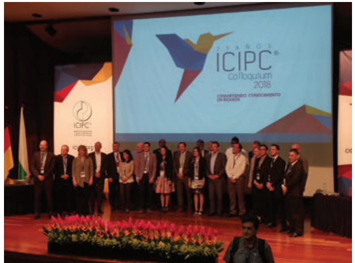
Speakers @ ICIPC 2018 Colloquium

SPE Extrusion Division also had a display in Spanish (see below) at the event to help solicit new SPE members.