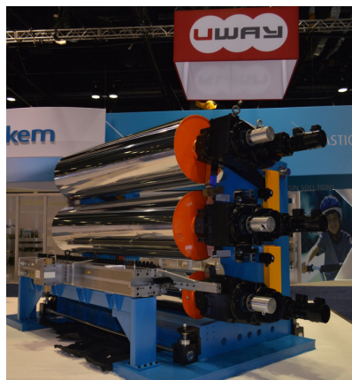
Uway Calendaring Roll Stand

machines. One of the largest rotary thermoforming machines ever made for the very large formed parts for the agricultural machinery sector has just been delivered to a major thermoformer in Europe. The machine is in the process of being commissioned and will be operational in April. The products to be made on this machine are parts in the region of 3 metres by 2.5 metres and will be for use in the agricultural machinery market.