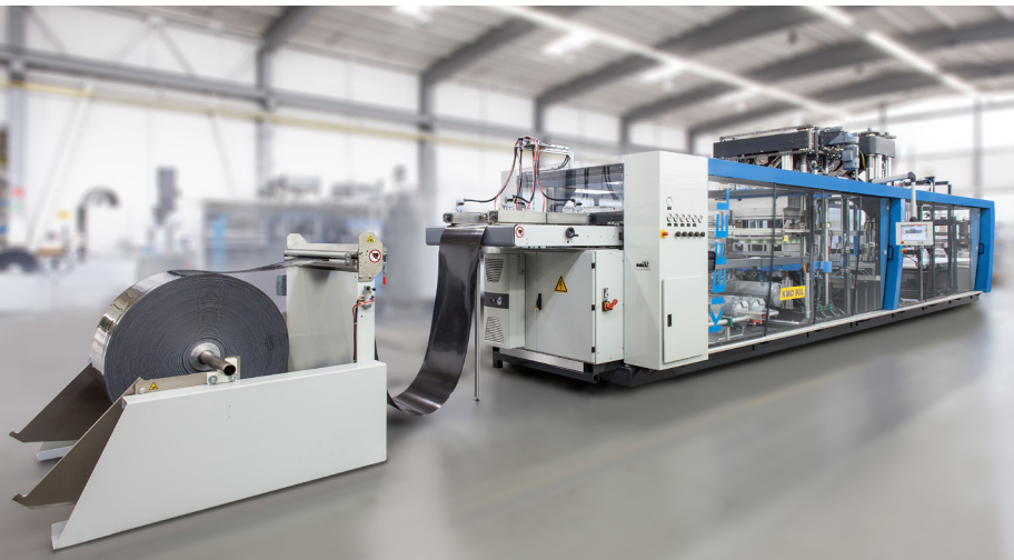
Image: Pressure Forming Machine KMD 90 SPEEDFORMER

The KMD 90 provides an excellent platform to reduce the overall cost of producing thermoformed products. The decreased scrap area, reduced amount of energy consumed, minimal change over and tool debug time are realized from day one. These factors combined with our Increased forming area, cycle speed, part quality and machine through-put make the KMD 90 an easy choice when looking for your return on investment.